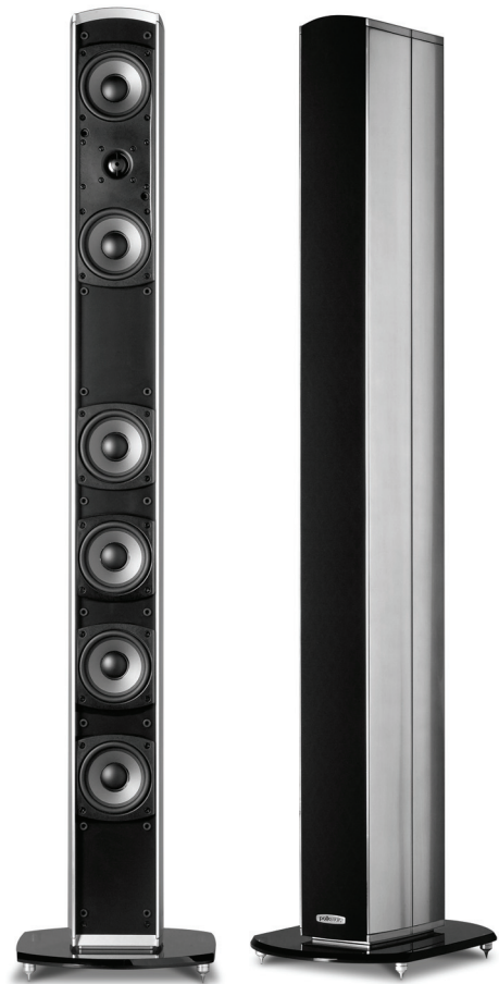
The VM Series perfectly complements today's most in-demand flat panel TV technologies. VM30 pictured here.