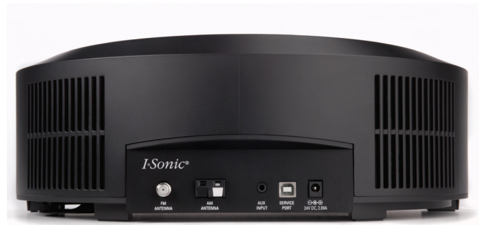
Back panel hookups include: external FM antenna, external AM antenna, auxiliary input (3.5mm) and power.