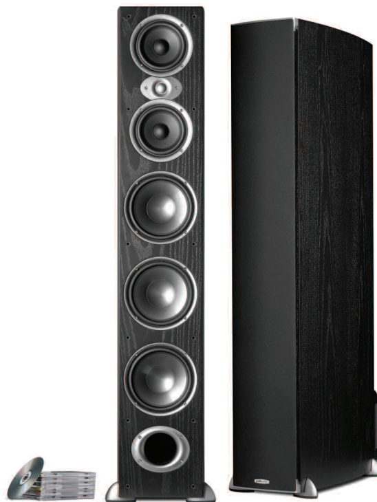
RTiA9 Floorstanding Loudspeaker