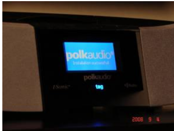
Figure 4 – Installation Successful