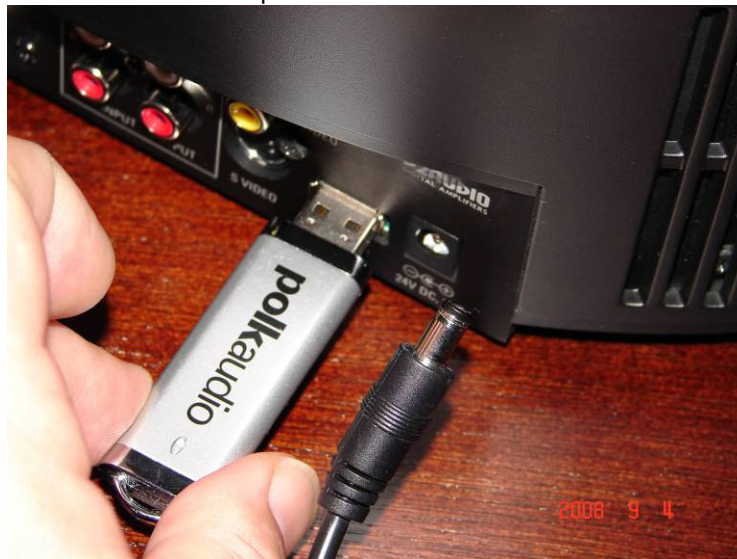
Figure 1 Power disconnected then insert USB drive