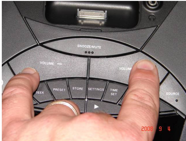
Figure 2 While holding the Volume buttons, re-connect the power